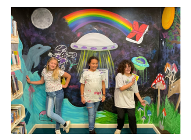
New mural at the Tusten-Cochecton Branch.

This year, the library collaborated with the Tusten Youth Club, Delaware Youth Center and the National Park Service to offer opportunities for children and teens both at the library and in the community.